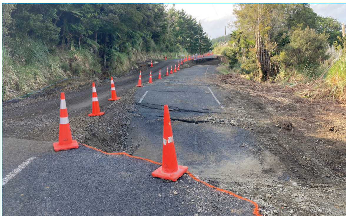
Repairs to two major slips on West Coast Road are expected to start early this year but may take some time. A detour remains in place for heavy vehicles at the Kohukohu slip.

Geotechnical engineers say that both West Coast Road slips have continued to move due to a combination of soil saturation caused by ongoing wet weather and local geology. Both sites have very similar characteristics to Mangamuka Gorge where a series of devastating slips have kept State Highway 1 closed since August.