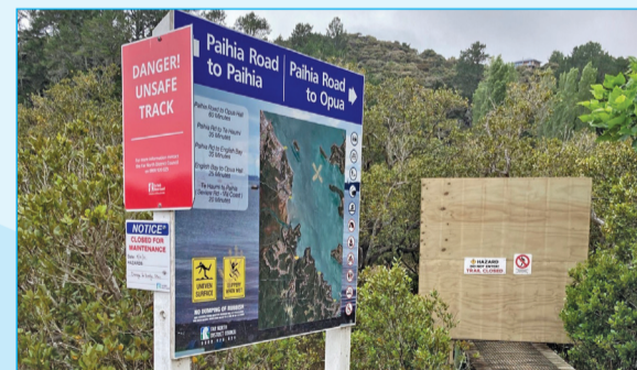
A popular coastal walking track has reopened, but more work is taking place in January.

A wooden boardwalk and bridge that form part of a popular coastal walking track between Ōpua and Paihia reopened in time for the Christmas holiday break.