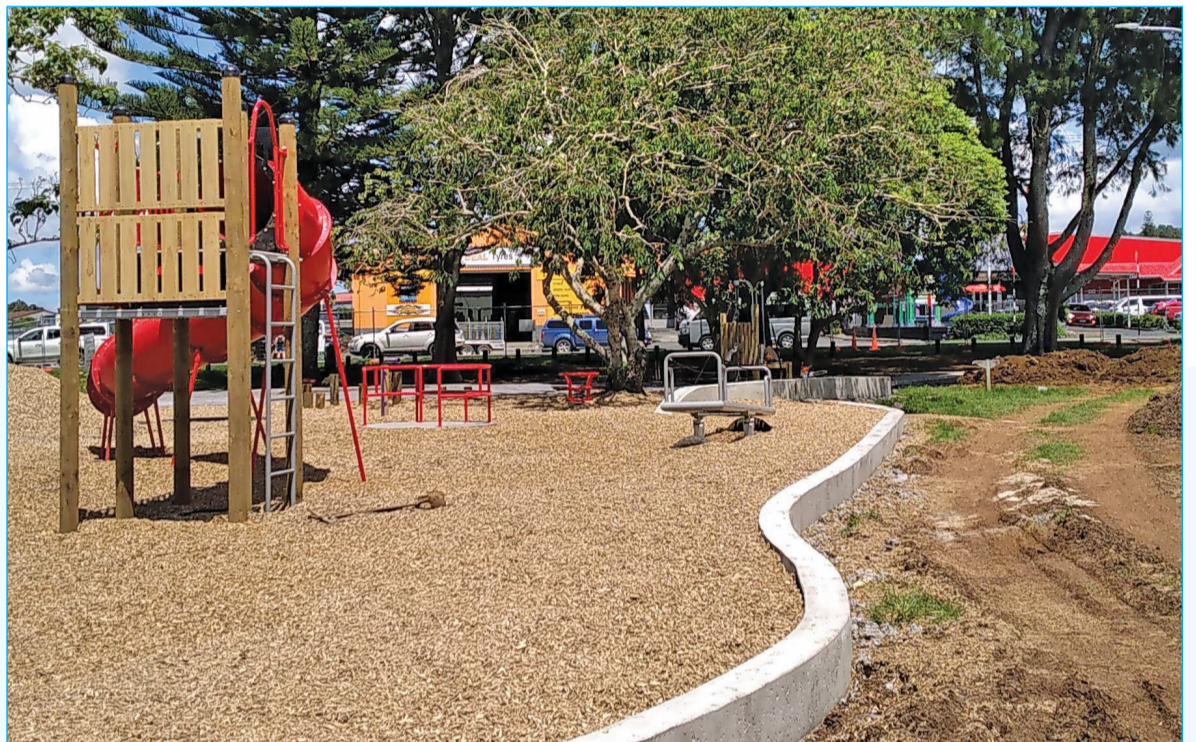
A grand opening for the upgraded Memorial Park in Kaikohe will be held in March 2023 once all works have been completed.

Construction is also due to begin shortly on concrete supports for pou and the learn-to-ride track. The southern grassed area of Memorial Park will close during this work, but the playground itself will remain open. However, the playground will be closed from Monday 13 February to Friday 24 February to allow a permanent rubberised safety surface to be poured and to then cure correctly.