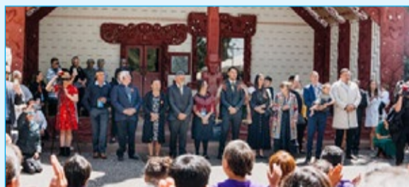
The use of te reo Māori and tikanga will be increased at Council.

Far North District Council is aiming to boost the use of te reo Māori within the organisation by 2025.