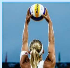
Teams from around the world will compete in Paihia next April.

The Events Investment Panel had $80,000 available to distribute, but with 27 event applications requesting more than $531,000 in total, the allocation of funding was a tightly-run event. See all successful applicants for the Events Investment Fund on our website.