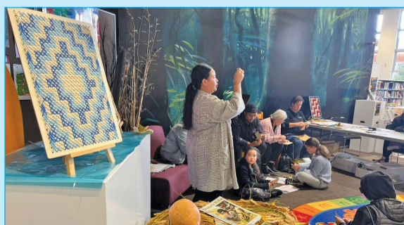
The ornamental lattice work of tukutuku panels made for a popular workshop at Kaitiāia Library as part of the Matariki programme.

Twenty-three children and 24 adults attended the workshop, keen to celebrate the significance of Matariki and to revive traditional Māori art, skills and mātauranga. The event provided a space for learning and the sharing of knowledge, guided by skilled artists and passionate community members, who wove together stories and traditions.