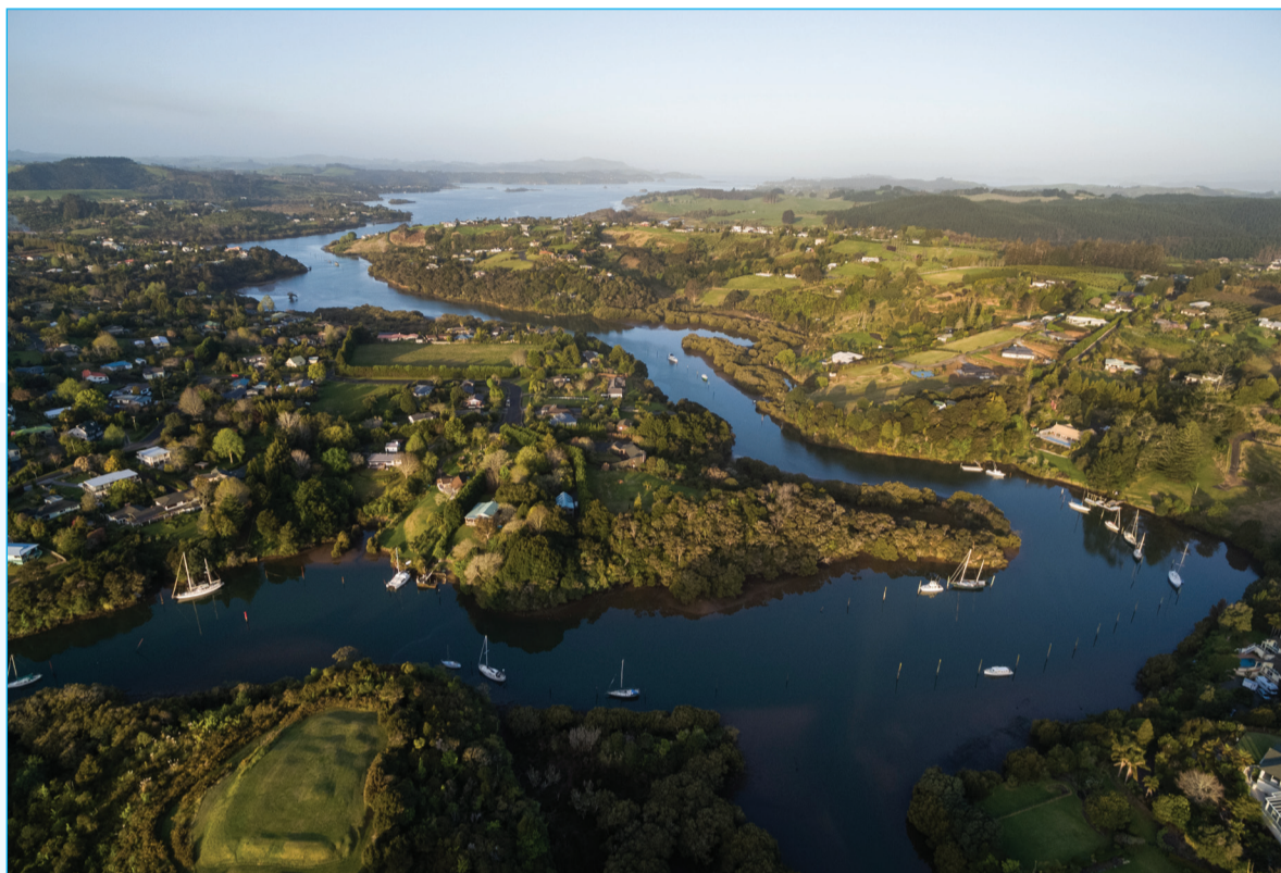
The 6.78 per cent rates increase required for operational expenditure does not mean all ratepayers will see their rates rise by that amount.

Property owners can find out what rates will be applied to their properties for the financial year by checking the Rating Information Database on the council's website.