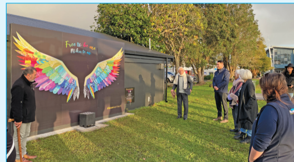
Visitors to Kerikeri Domain can stand in front of the art installation to take the form on angel with the click of a camera.

'Taking flight' in the image of an angel is now possible for visitors to Kerikeri Domain, thanks to an angel wings art installation – a community project led by Ngā Anahera Pākira Bald Angels charity.