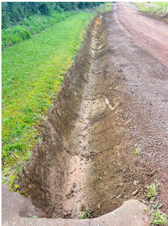
Lodore Road Water Tabling