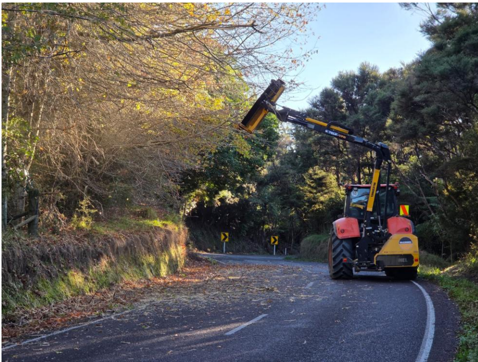
Russell-Whakapara Road – (Road under stop/go for this section)