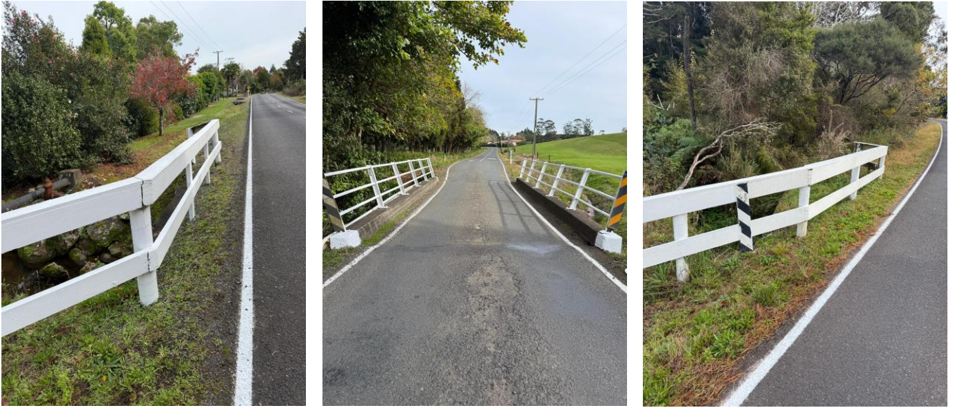
Barrier / Bridge Painting