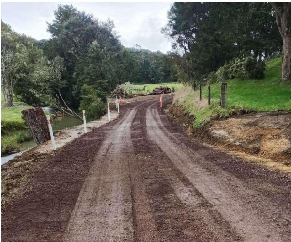
Before / After Owae Road Slip Repair