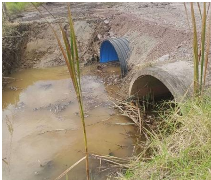
Koutu Loop Road (progress photo)