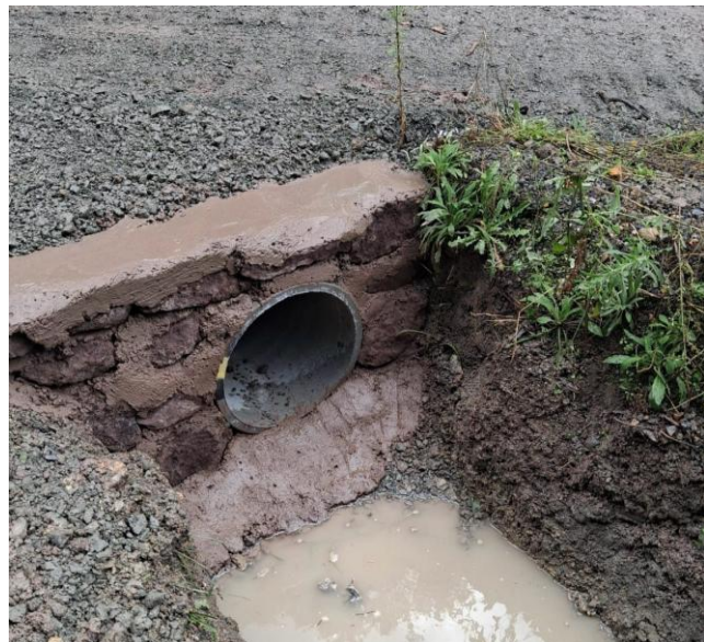
Pokapu Road / Tapuhi Road Culvert Renewals