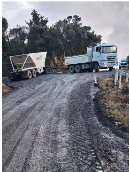
Horeke Road (Utakura Valley)