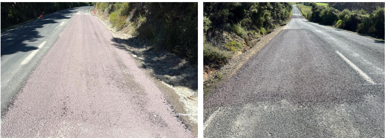
Stabilised Patches Rawhiti Road