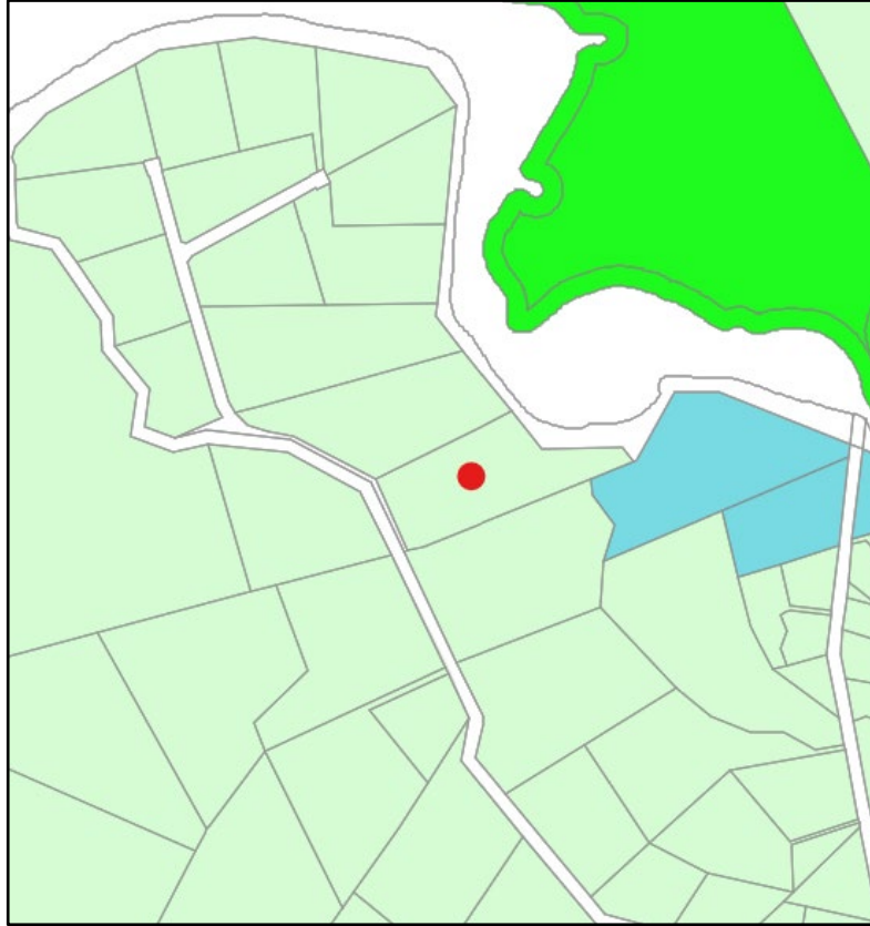
Image 1: Red dot shows submitters site (Green= Rural Production zoning)

6. The submitters site has an area of 3.7 hectares as shown below: