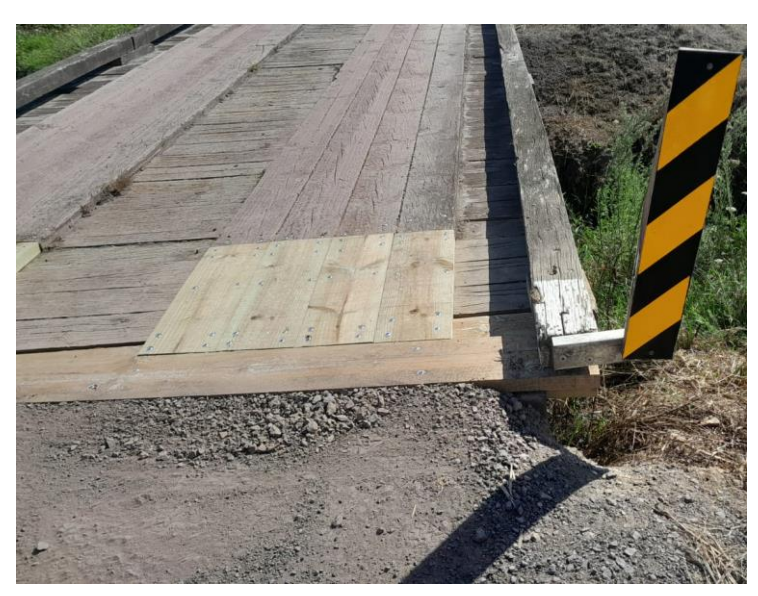
Wallis Road Bridge Repair

Our concrete crew made repairs on the Rawene Seawall on Clendon Esplanade, after storms last year caused erosion and undermining. After multiple temporary repairs, we were finally able to time the tides and the concrete pump to complete the job.