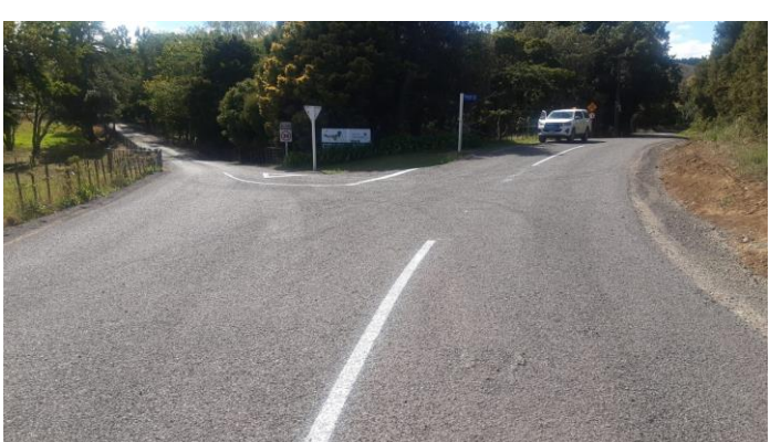
Cumber Road Rehab