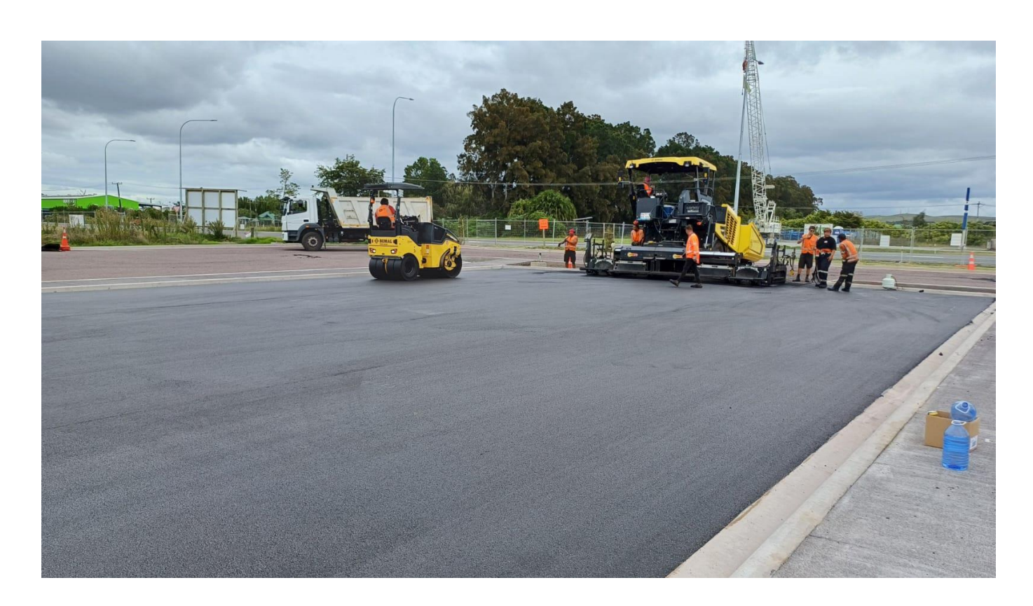
Waipapa Sports Complex