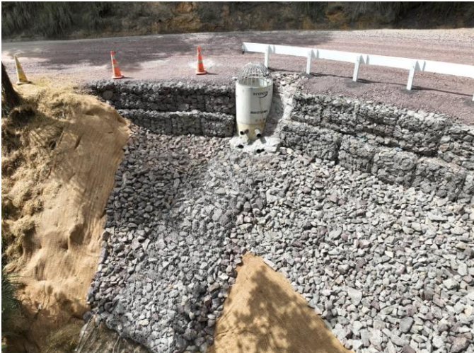
Waikare Slip Repair

Future work for the construction team will include slip repair on Ngapipito, kerb and footpath upgrades in the Hokianga and Bay of Islands/Whangaroa wards, and the boat ramp/car park upgrade in Russell.