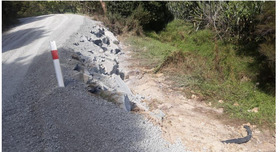
Kaka Road Before /After