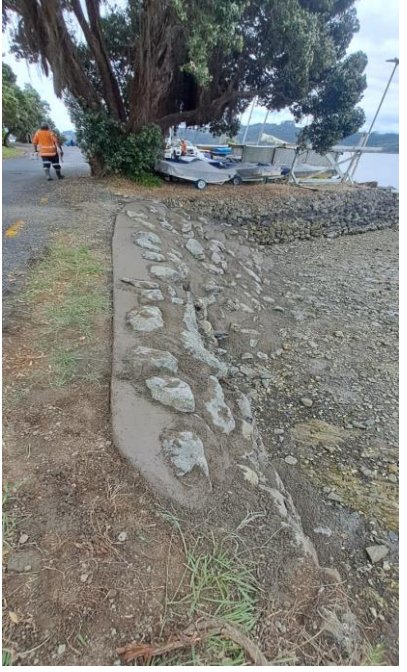
Rawene Seawall Repair