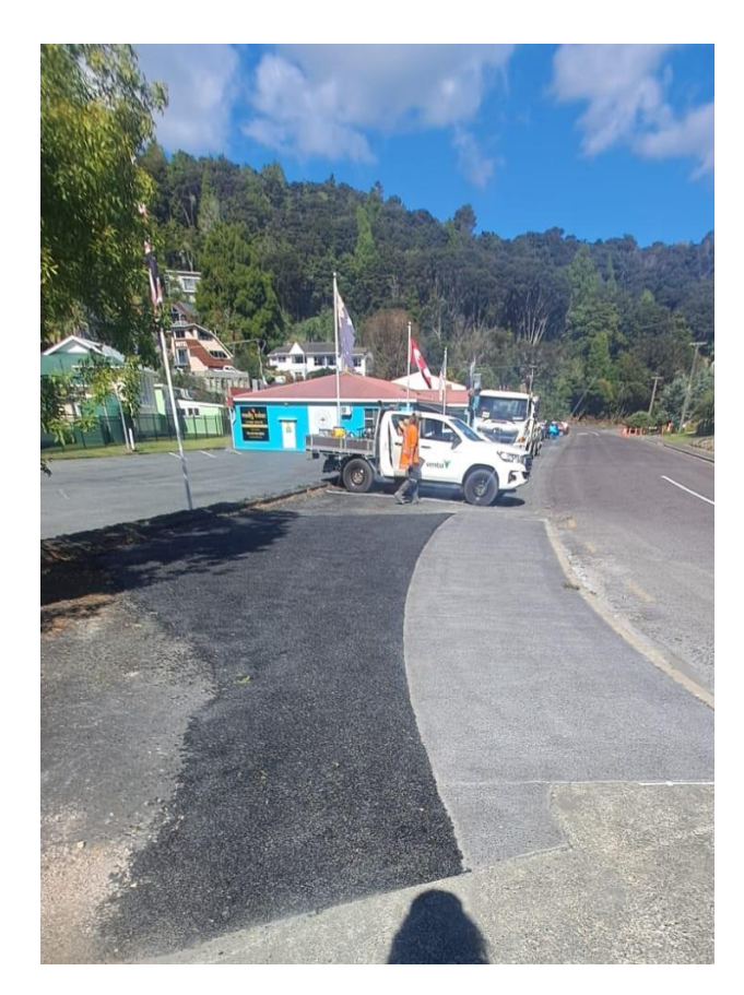
Yorke Road /Joyces