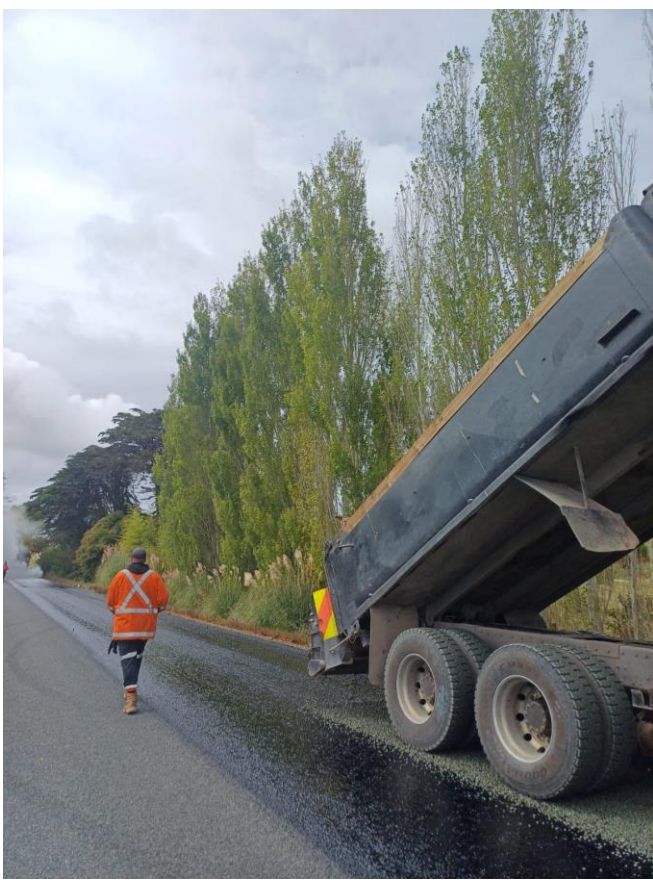
Kerikeri Rugby Club / Cumber Road

In late March we started the Asphalt resurfacing of Cobham Rd in Kerikeri. This work was carried out under night shifts and will continue until mid-April. This project involves approximately 10,000m2 of surfacing works along with some additional drainage and shoulder works down towards Kerikeri Inlet Road. A big thank you to the residents who have been very patient with the late night noise and disruption for the last couple of weeks.