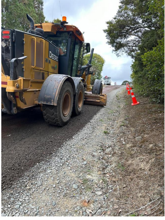
Happy Valley Road