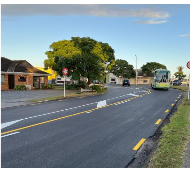
Cobham Road Kerikeri