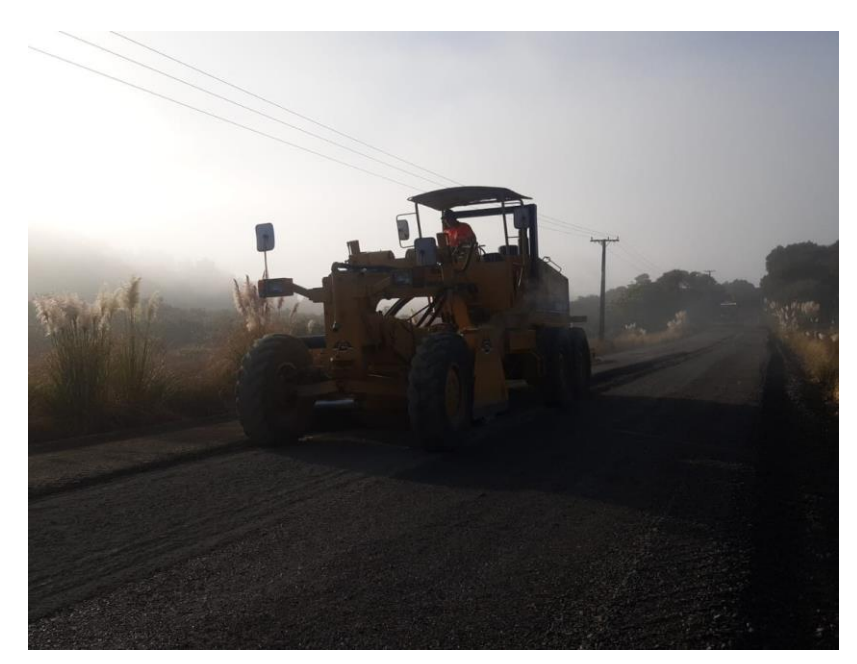
Paroa Bay Road - Russell