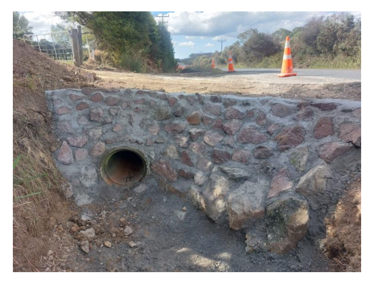
Waimate North Road