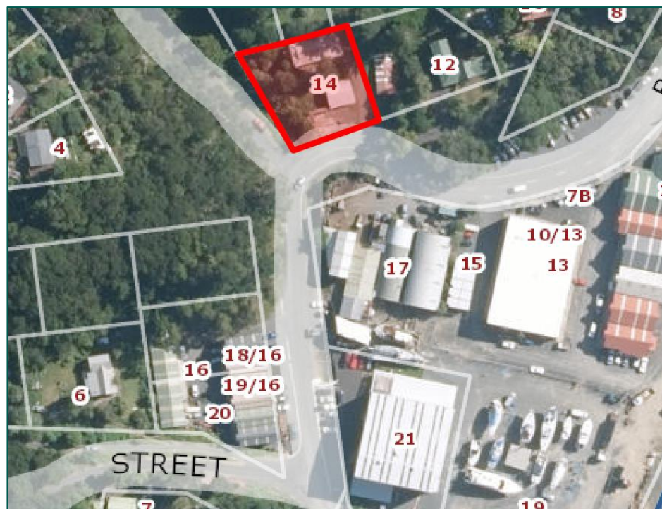
Figure 1: Locality Plan of NZMPL's Site of Interest

The PDP is of particular interest to NZMPL, as landowners of 14 Baffin Street, Opuā. The site is held in a single Record of Title (RT) referenced NA1857/84 and legally described as Section 9 Block XXII Town of Opuā. The site measures 1179m 2 with existing development comprising a detached residential unit, garage and access. The site is located on the corner of Baffin and Kellet Street, adjacent to Opuā’s industrial marine park, as shown in Figure 1 below.