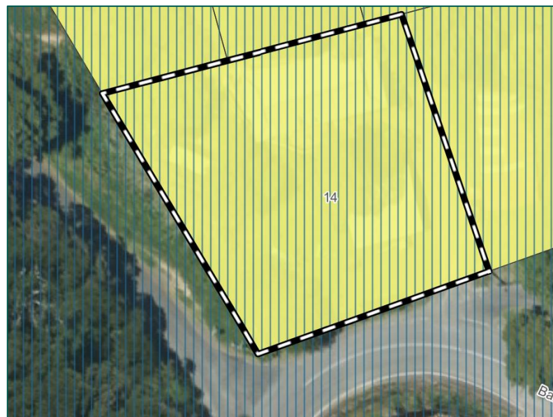
Figure 3: PDP Zoning and Overlays

As proposed, General Residential Zone ( GRZ ) with a Coastal Environment Overlay ( CE ) has been applied to NZMPL’s site of interest.