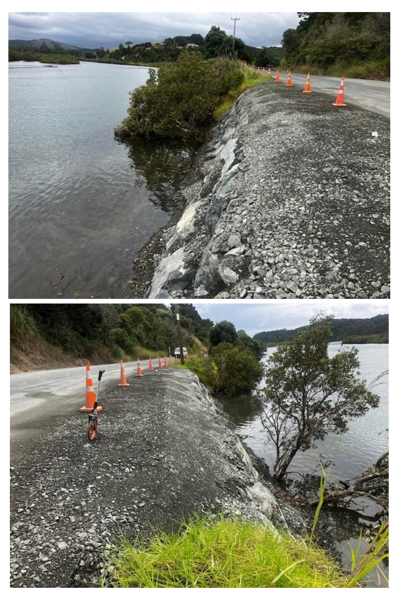
Completed Storm Damage Repair Oruru Road