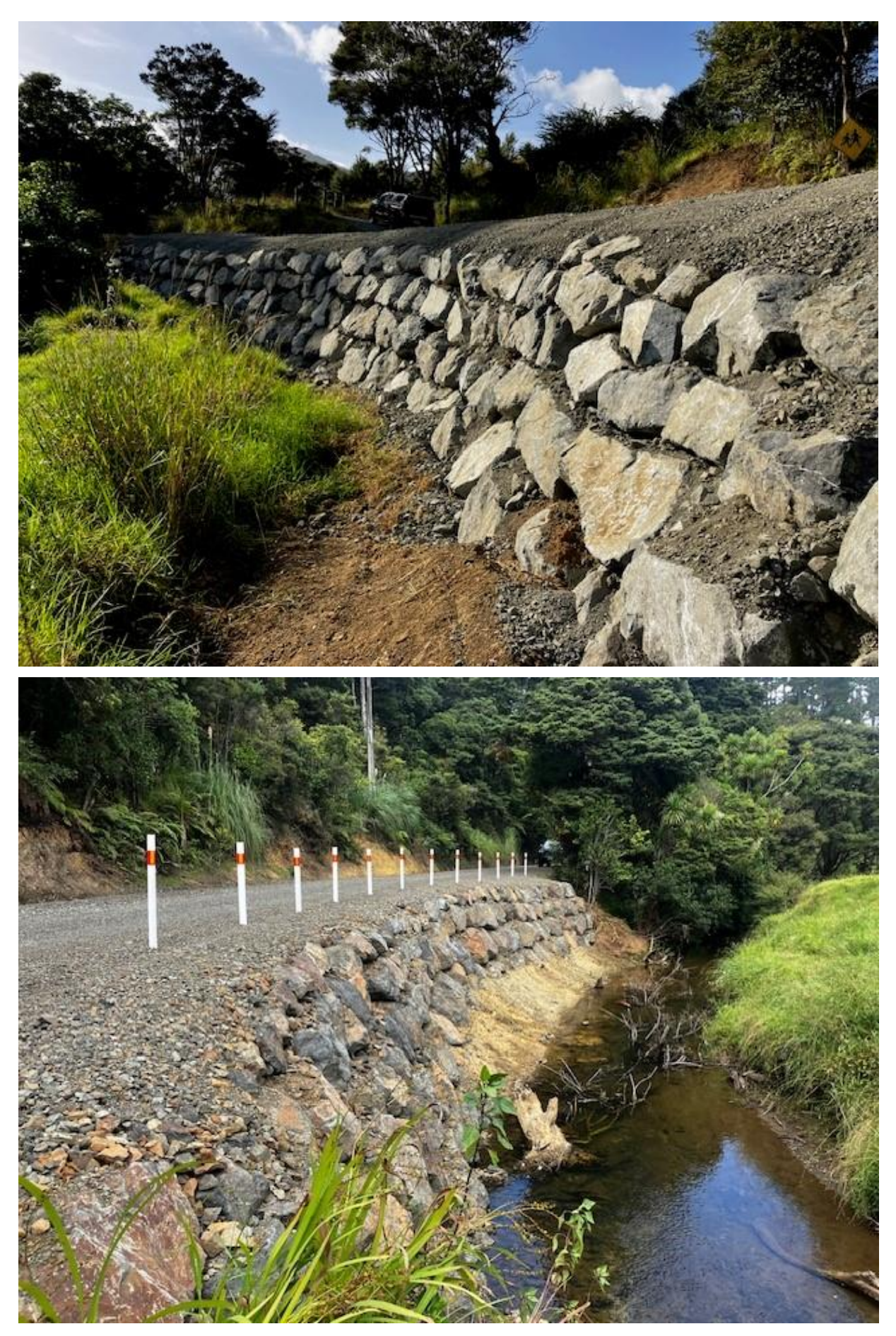
Completed Storm Damage Repair Okakewai Rd (Above) and Diggers Valley Rd (Below)