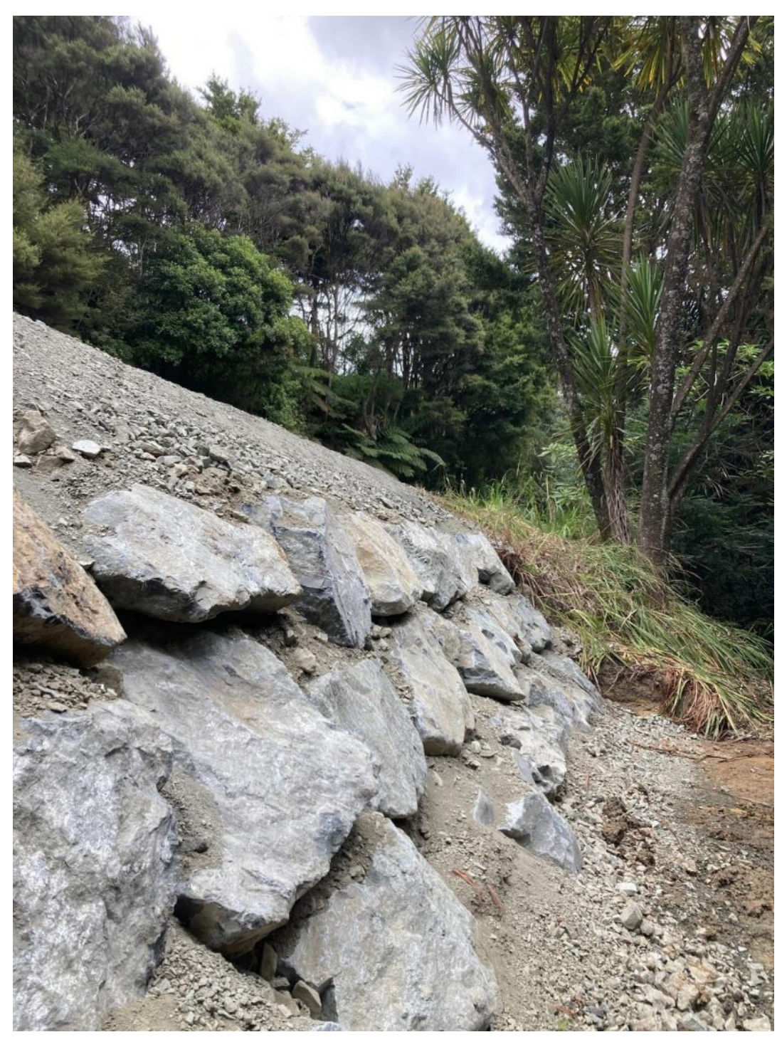
Storm Damage repair completed on Duncan Road

March has been a busy month with great progress made on all contract works, thankfully great weather conditions have allowed us to box on this month. Routine grading, mowing and sealed and unsealed potholing have kept us busy. April will see our teams finishing our sealed construction program, with the focus moving to unsealed renewals over the coming months. Storm damage works are progressing well, with many of the sites from the 2022 and 2023 weather events now complete.