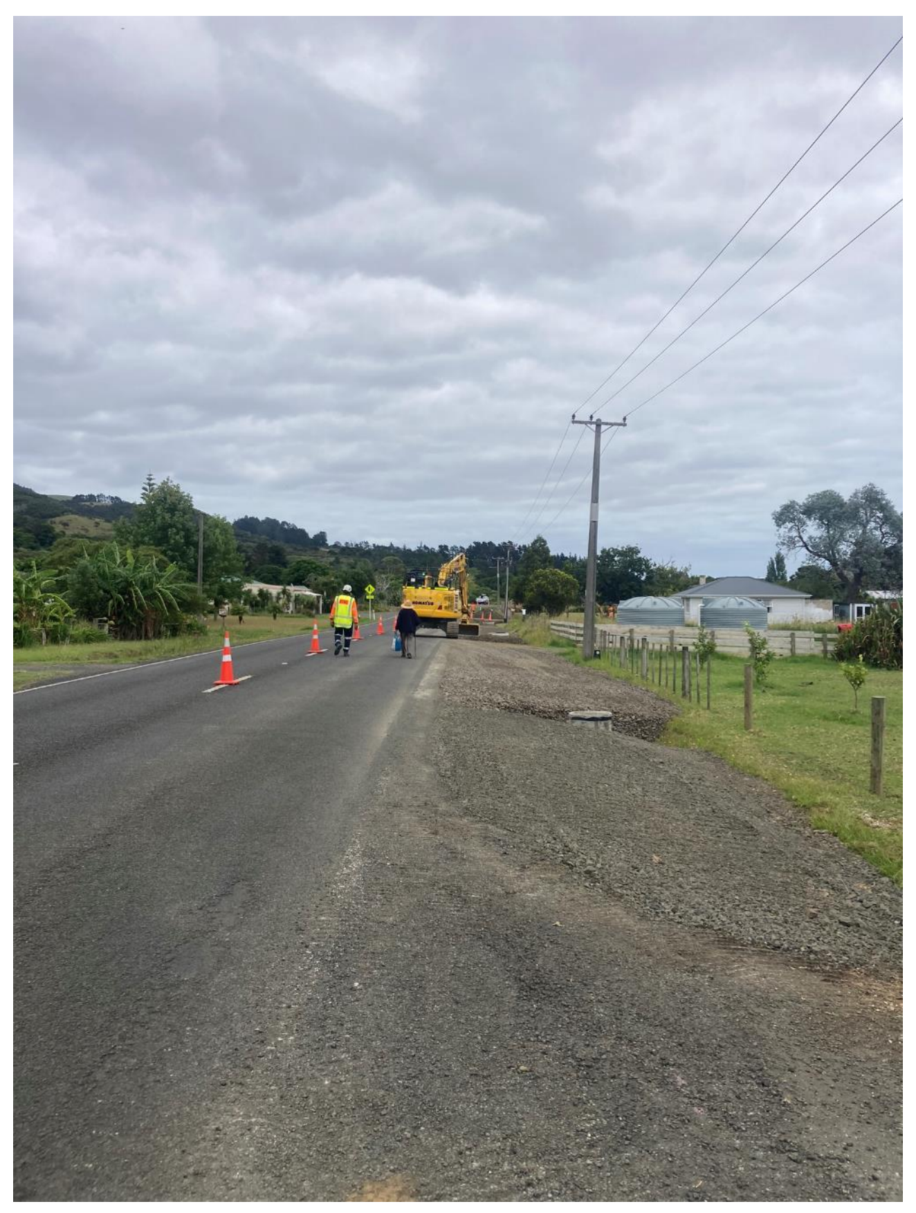
Pukepoto Safety Improvements

Roadside drains replaced with subsurface drainage to prevent roadside hazards, also enabling works for a future footpath. Pedestrians are accompanied through the site whilst construction takes place.