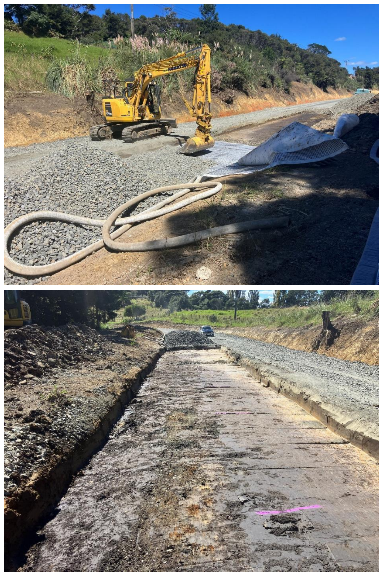
Drainage improvements in progress Ruaroa Rd Seal Extension