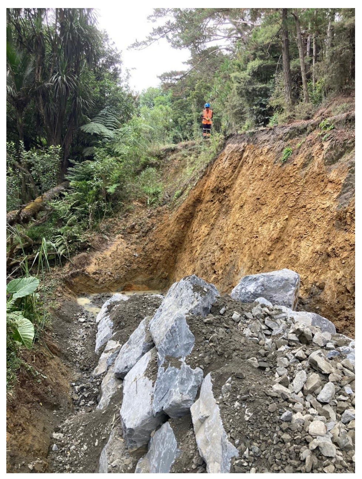
Storm Damage Repair in Progress Duncan Road