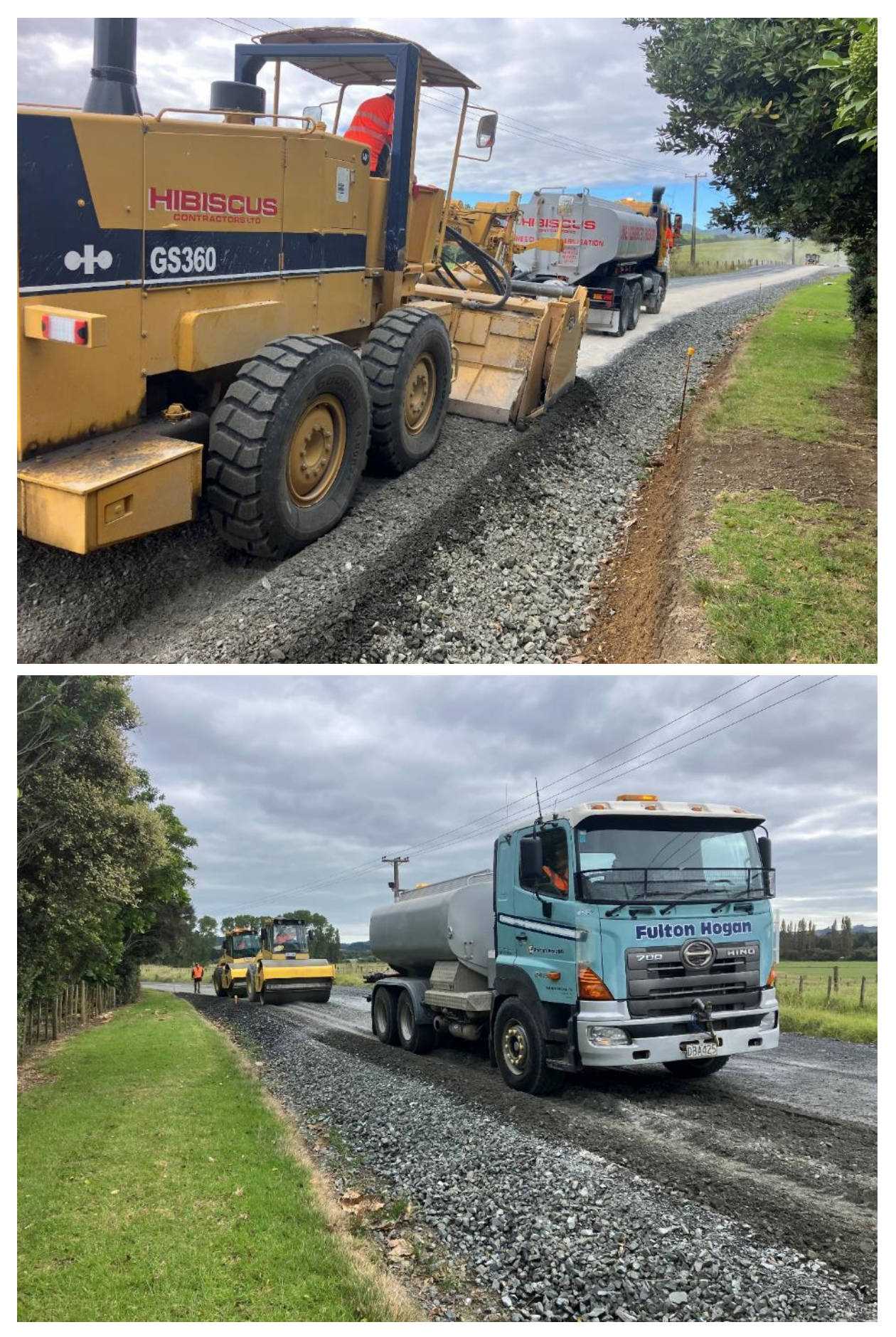
Stabilisation in progress Ruaroa Seal Extension