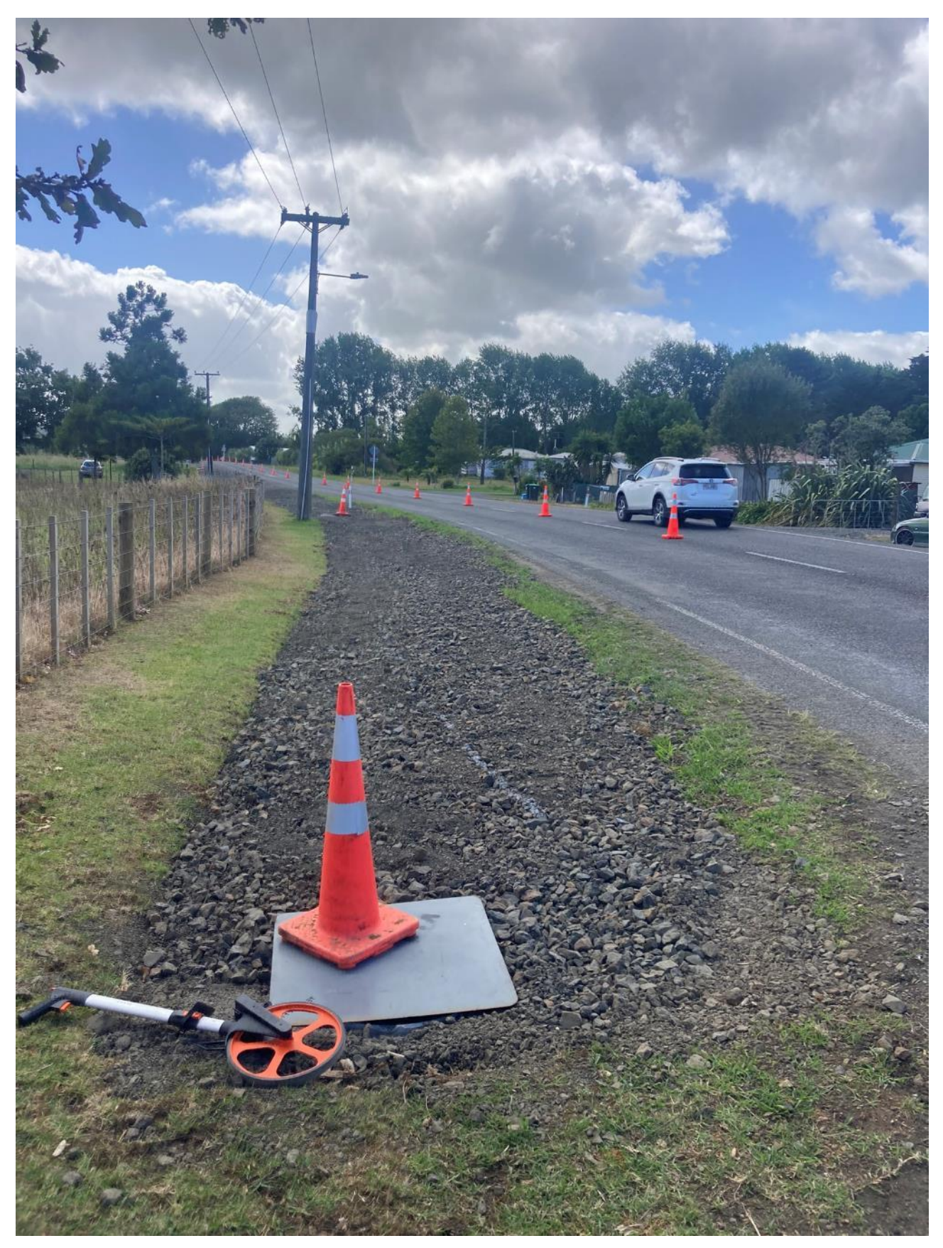
Pukepoto Safety Improvements