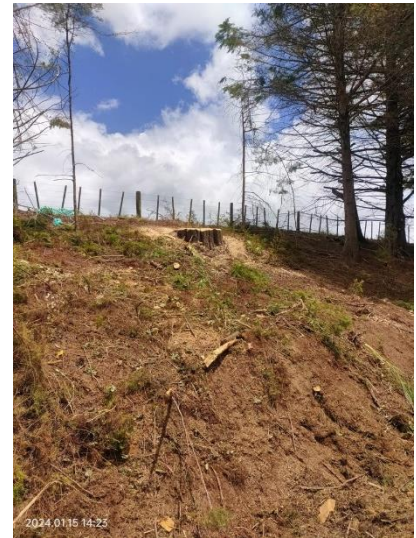
Te Ahu Ahu Road