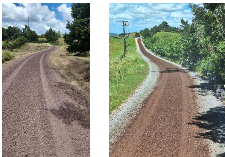
Waikuku Road / Redcliff's Road

Maintenance metal was put on 5 roads across the network including Purerua Road, Redcliff's Road, Waiare Road, Te Kowhai Point Road and Waikuku Road.