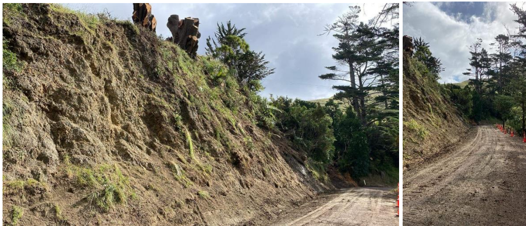
Waiotemarama Gorge Tree Removal