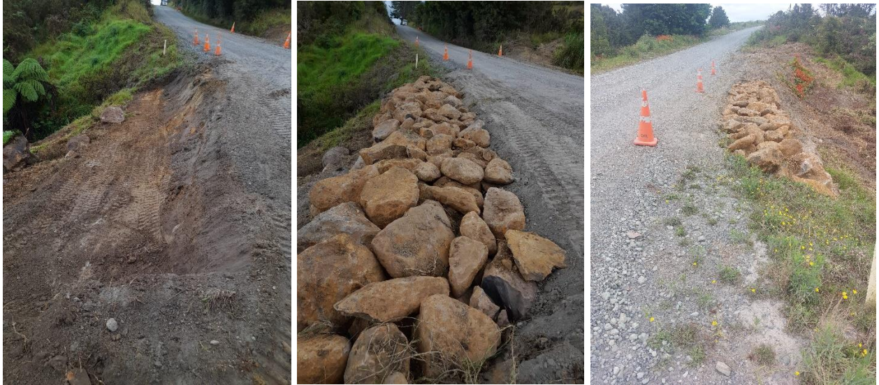
Lake Road Under slip repair

DCL and NTW carried on with the remaining tree works and completed another retaining wall on Lake Road.