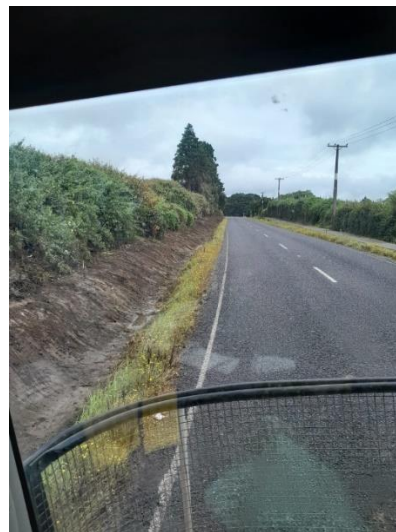
Drainage works Puketi Road / Thorpe Road