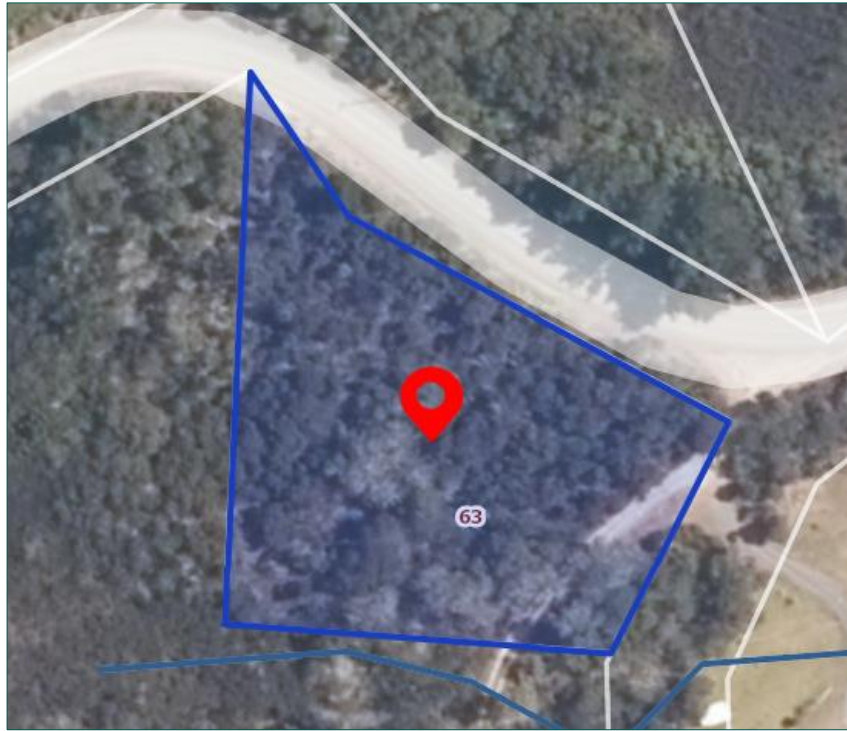
Figure 2: 63 Trig Road, Houhora