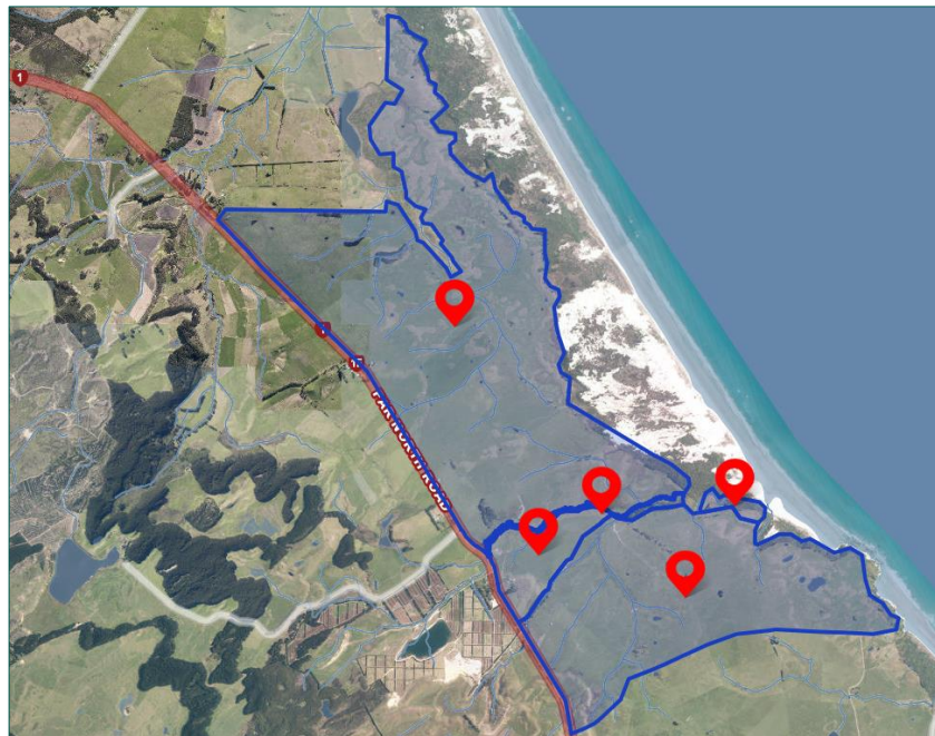
Figure 3: 5600 Far North Road, Ngataki