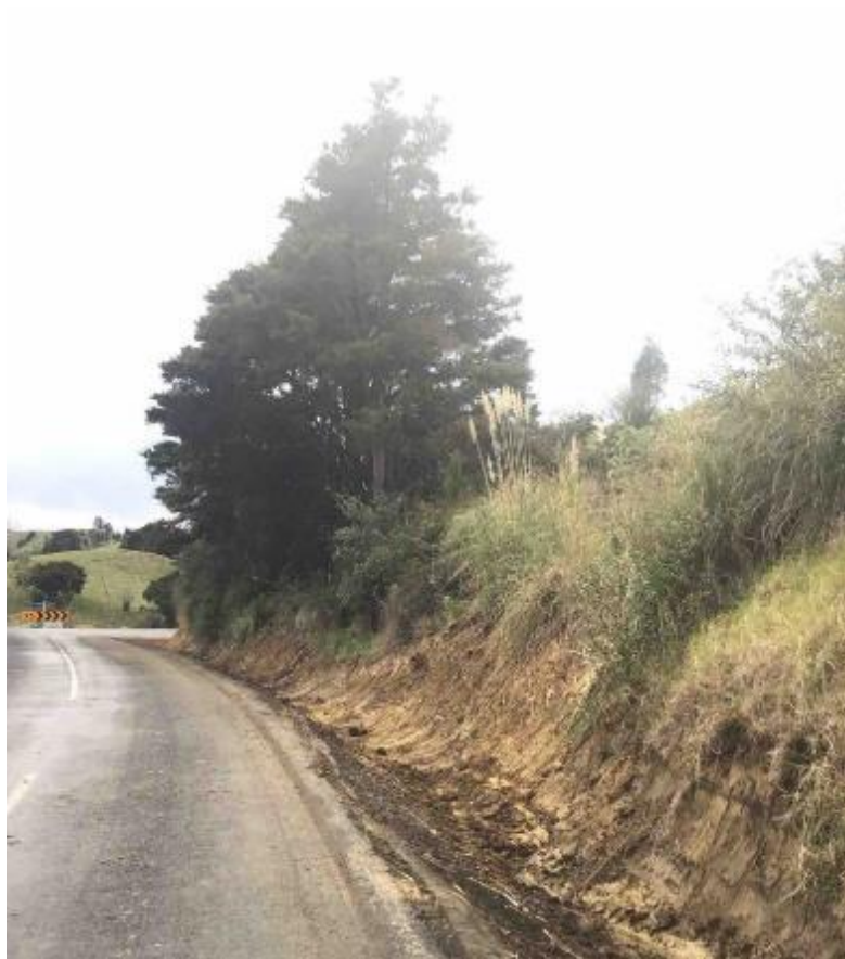
Fairburn Rd – pre-reseal watertabling