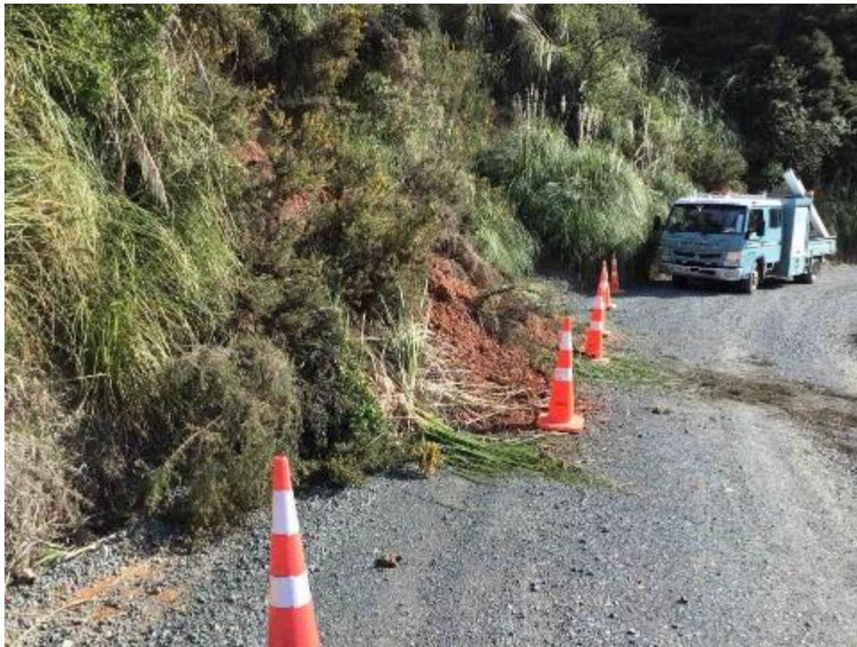
Backriver Rd – Overslip Clearing