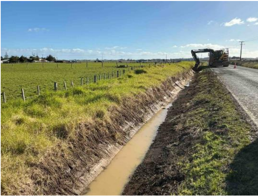
Quarry Rd – Pre-reseal watertabling