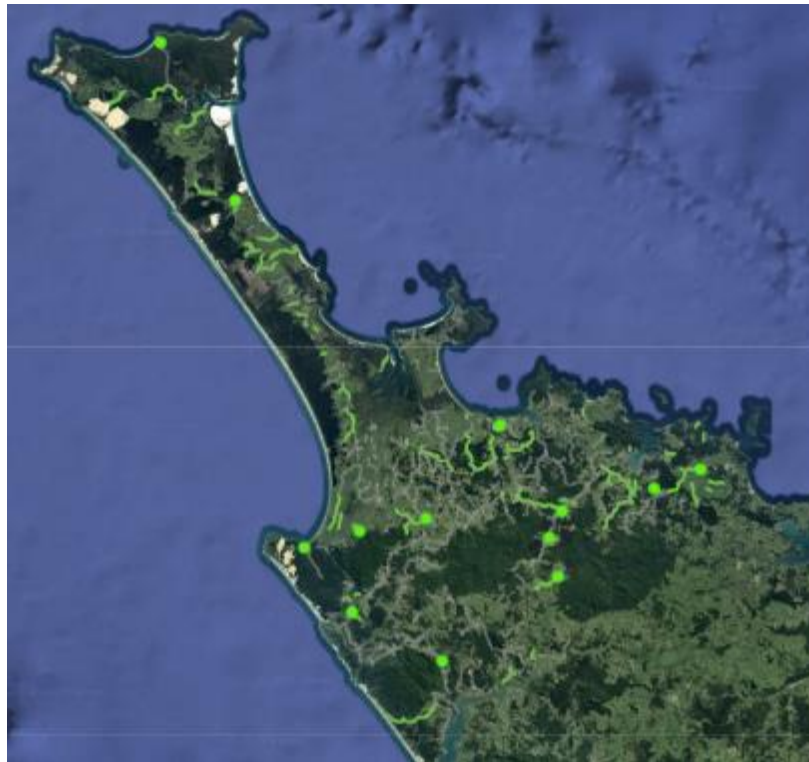
Figure 2: Locations of grading completed (highlighted green)