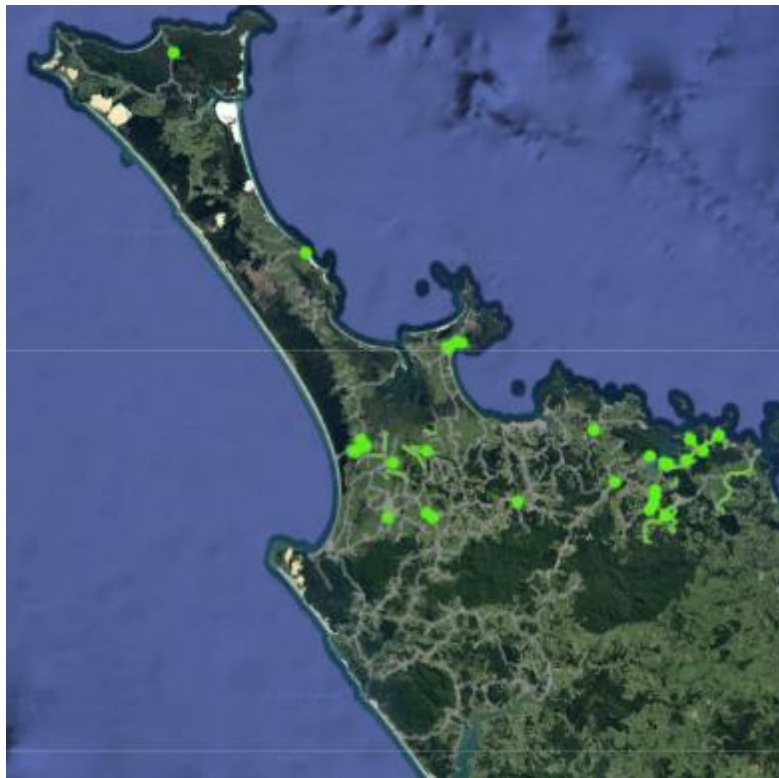
Figure 4: Locations of roadside mowing completed (highlighted green)