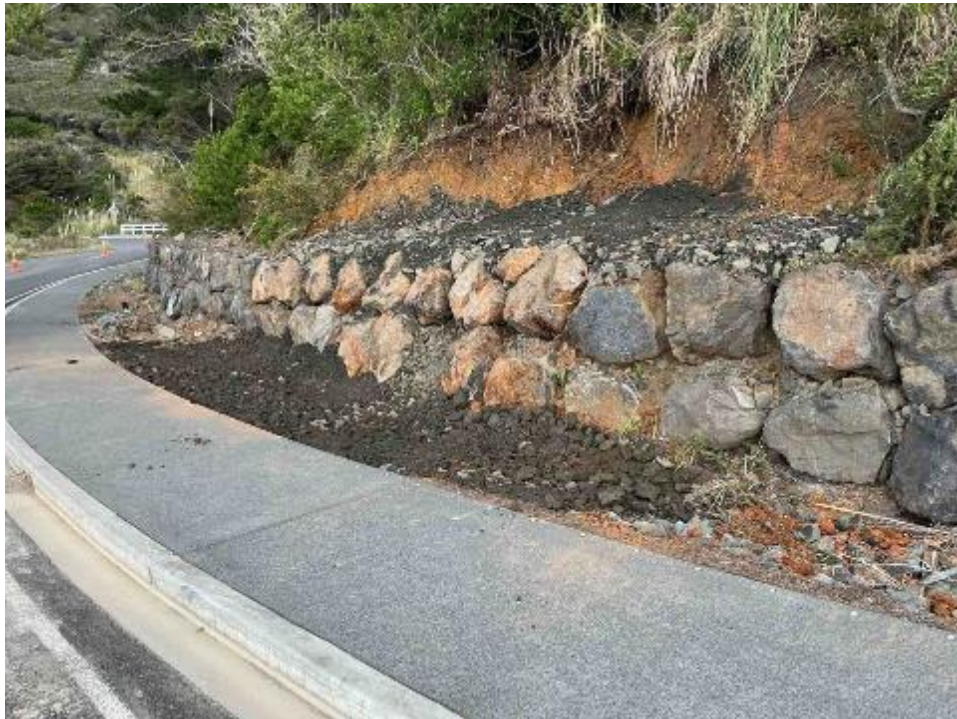
Foreshore Rd – Rockwall Repair