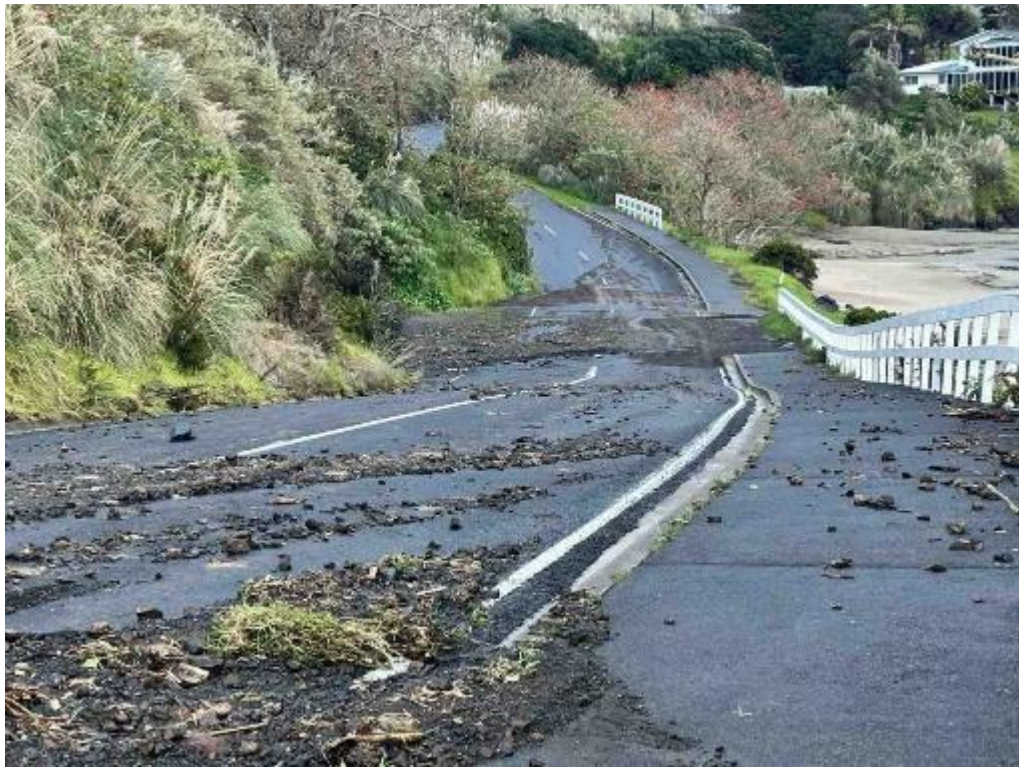
Foreshore Rd – Storm Damage