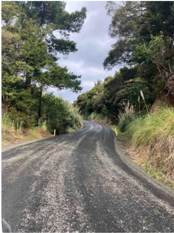
Paponga Rd – Heavy metal overlay