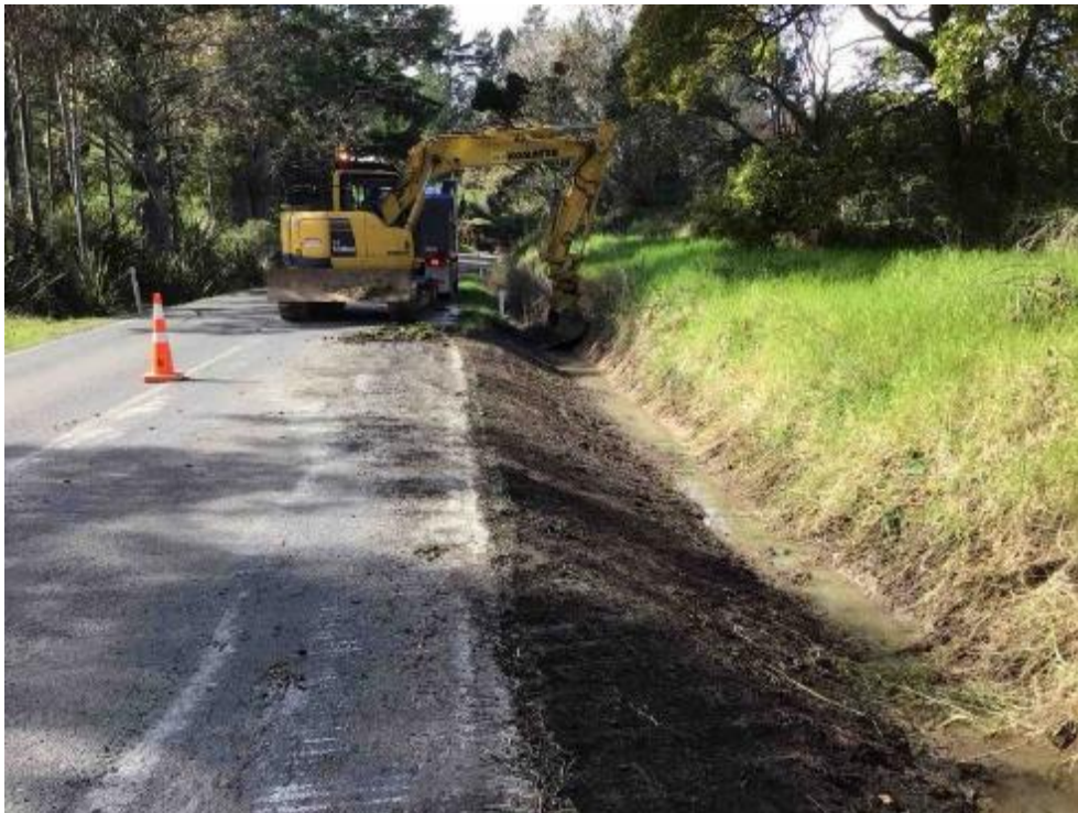
Awaroa Rd – Pre-reseal watertabling