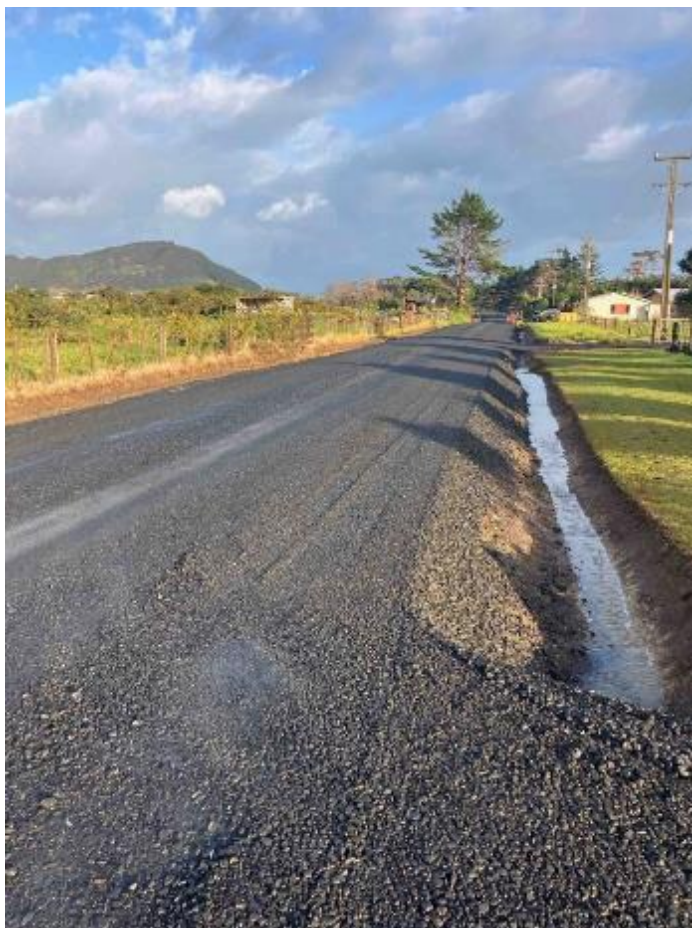
Wainui Rd (Ahipara) – Road upgrade