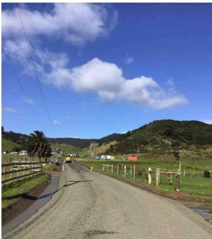
Wainui Rd – new drainage and heavy metal overlay

We have also made a great start on our pre-reseal repairs program, having completed a number of watertabling sites already.