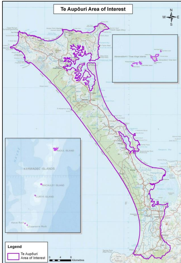
Figure 1: Te Aupōuri Area of Interest (Refer to Attachment B).