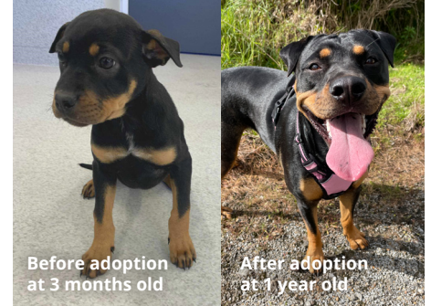
Before adoption at 3 months old

Follow facebook/adoptadogFNDC to find out more