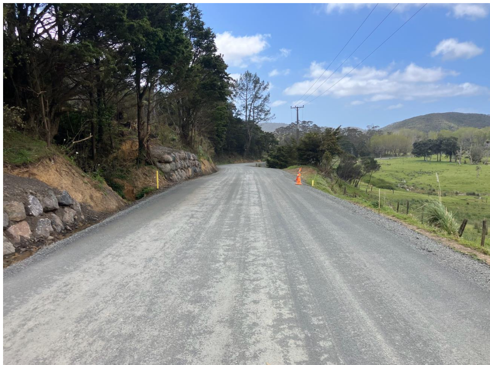
Pawarenga Rd Seal Extension Prepped for Seal