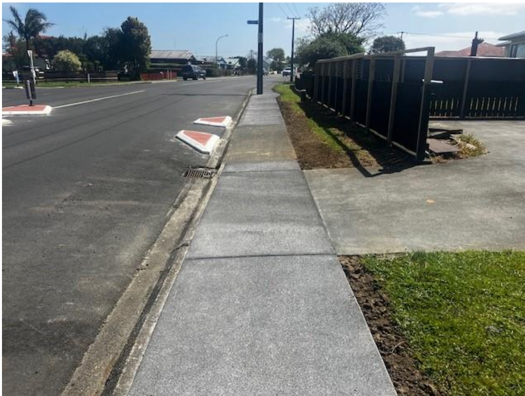
Pukepoto Road Footpath Renewal