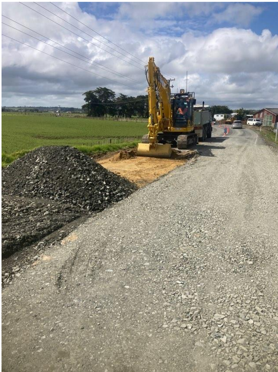
Gills Road Pavement Rehab Pavement Undercuts

October will continue on with a similar program, hopefully with better weather conditions.