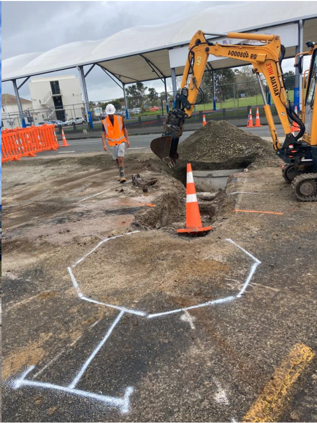
Sommerville Ave SW Upgrade Manhole Delivery and Installation