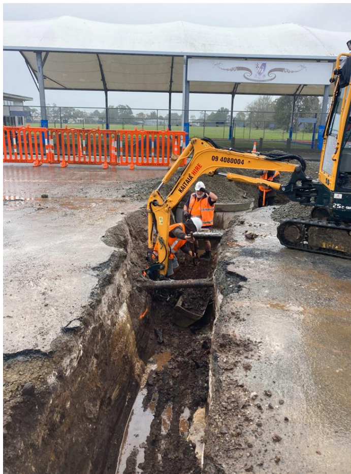
Sommerville Ave SW Upgrade Pipe Installation