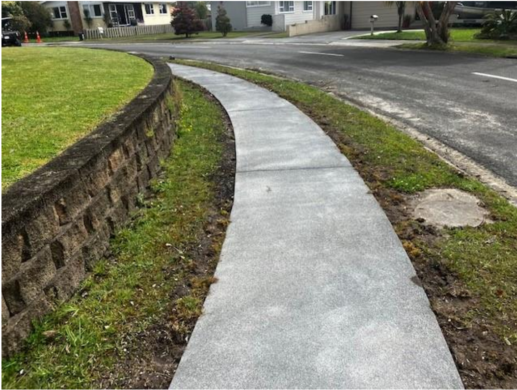
Masfen Terrace Footpath Renewal