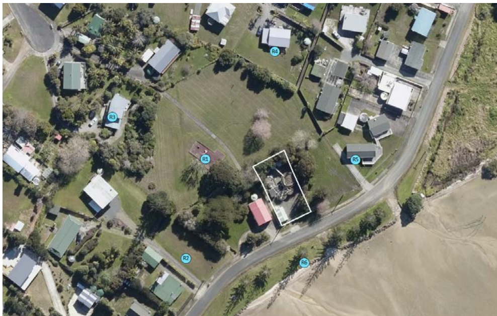
Figure 3: Receptor Locations Near the Hihi WWTP