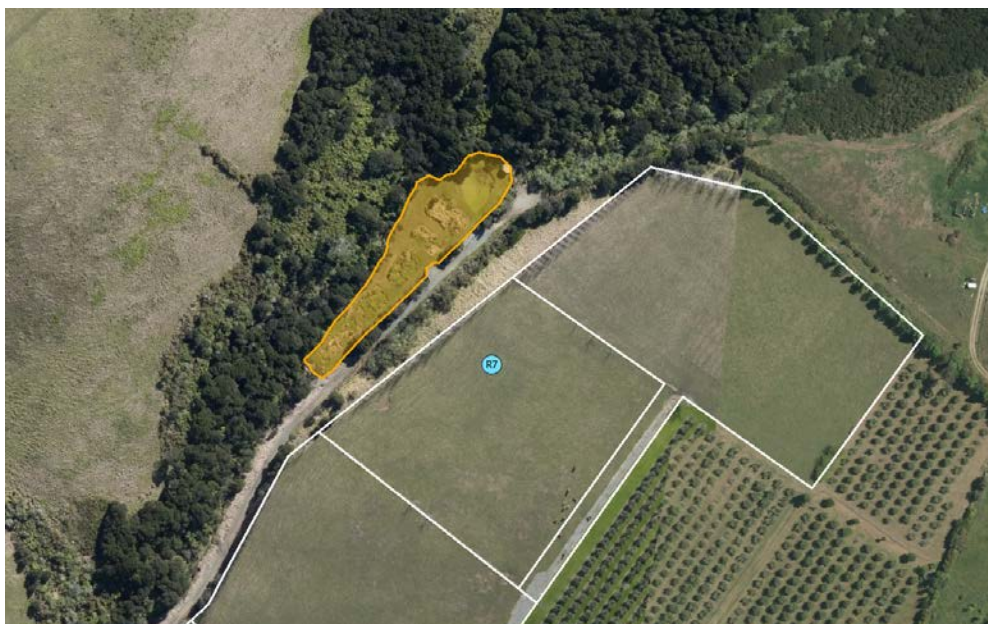
Figure 4: Receptor Location Near the Wetlands Discharge