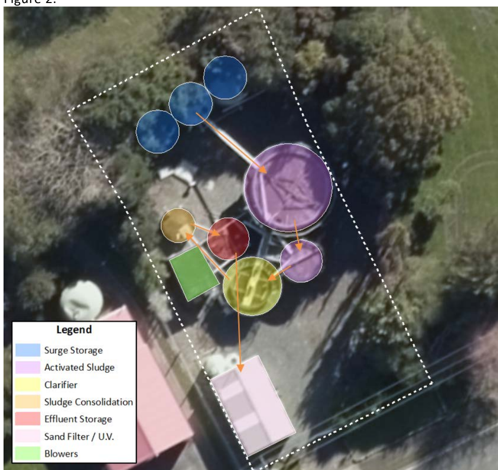
Figure 2: Hihi WWTP Process Flow

The Hihi WWTP serves a community of approximately 200 people, with a peak summer population estimated at over 500. The WWTP is a multi-stage treatment process, which includes an activated sludge system with tertiary sand filters and UV disinfection that discharges to a wetland system and into the local Hihi Stream. The waste sludge from the plant is removed from site and treated in either the Taipa or Kaitaia WWTP's. A flow diagram for wastewater treatment is shown in Figure 2.