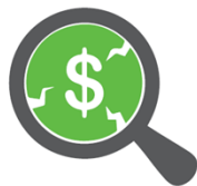
Te Miromiro Assurance, Risk and Finance