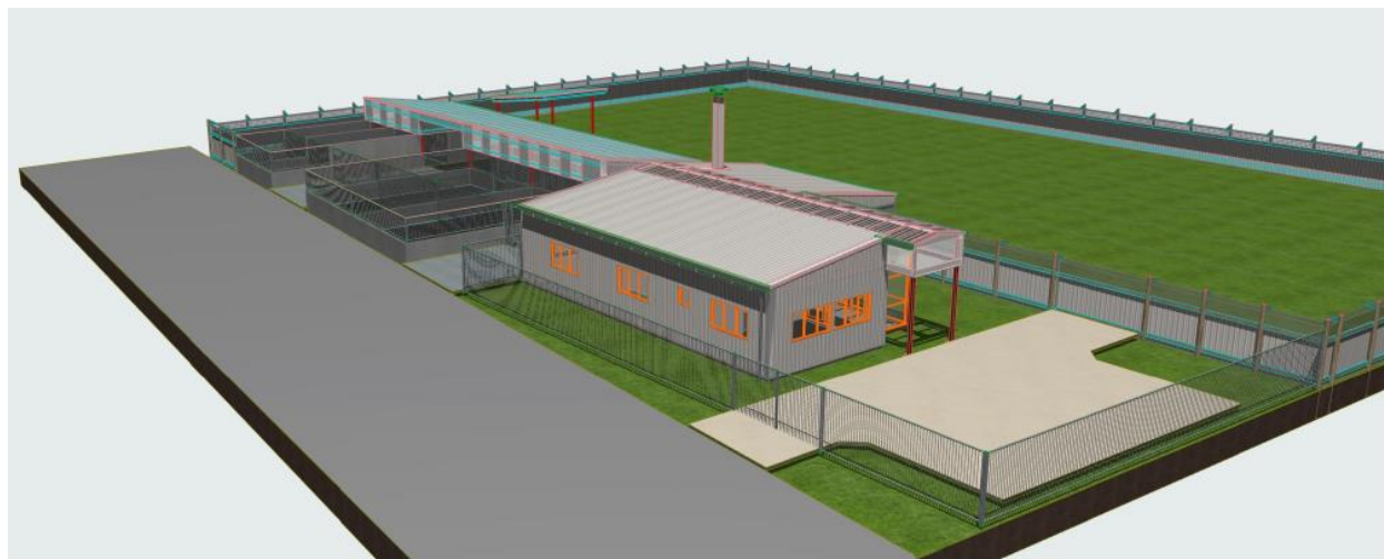
Concept Drawing Southern Animal Shelter - Kaikohe

A second shelter in Kaikohe is expected to be operational mid-2023.